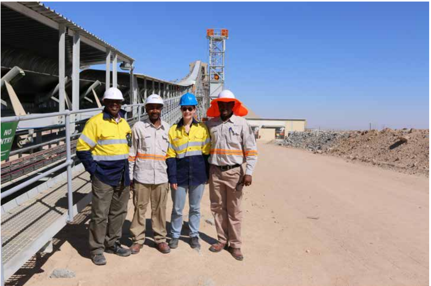
Recent Chamber of Mines site visit to Husab mine, with a 2 kilometre long conveyor belt in the background.