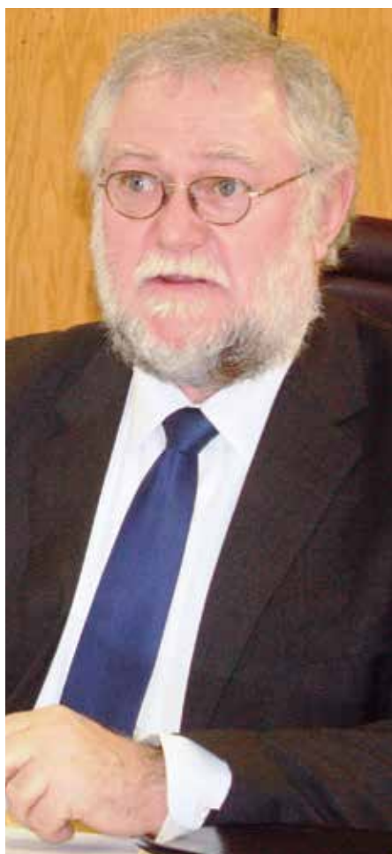
Finance Minister Calle Schlettwein.

All goods specified by the minister in the