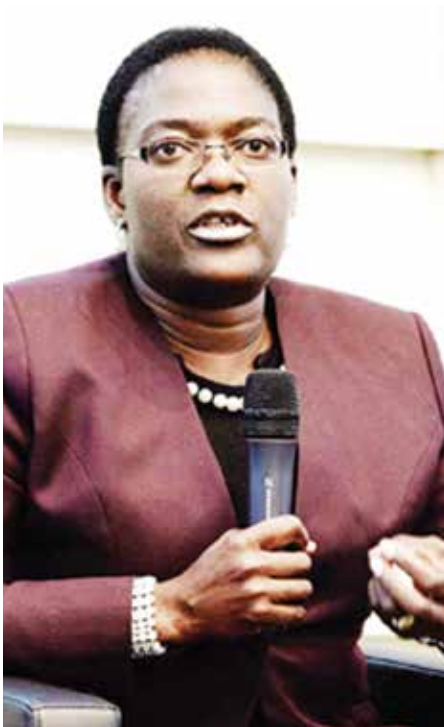
Deputy Minister of Mines and Energy, Kornelia Shilunga