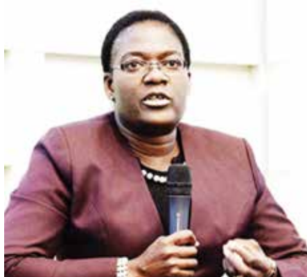
Deputy Minister of Mines and Energy, Kornelia Shilunga

"In each and every discipline we need rep-